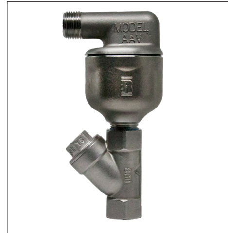
Model AAV Automatic Air Vent