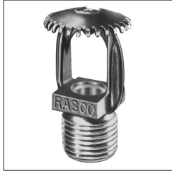
Model F1 Standard Upright

Models G and F1 standard upright and pendent sprinklers distribute water laterally and downward in a wide pattern approximating a half sphere. This hemisphere is completely and uniformly filled with water in the form of small drops and spray. A circular area, from 12 to about 20 ft. (3.7 to 6.1m) in diameter, is covered 10 ft. (3.0m) below the sprinkler at minimum water discharge pressure. See Technical Bulletins 110, 117 and 013.