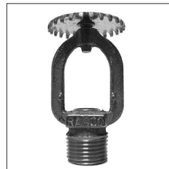
Model G Standard Upright