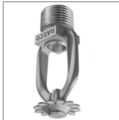
Model G Standard Pendent