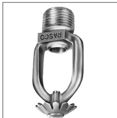
Model G Standard Conventional

The sprinklers distribute approximately 60% of their water discharge upward towards the ceiling with the balance downward. They may be installed in either the upright or pendent position. See Technical Bulletins 110, 117 and 013.