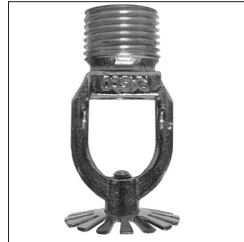
Model F1 Standard Pendent