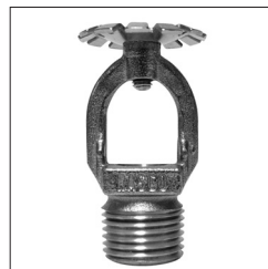
Model F1/F156 Standard Conventional

For specific water distribution information, refer to the spray distribution section of www.reliablesprinkler.com .