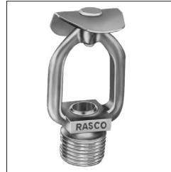
Model G Vertical Sidewall

The Model G & F1 Vertical Sidewall Sprinklers may be installed in either the upright or the pendent position, and are intended for light hazard occupancy use. The Model G & F1 Horizontal Sidewall Sprinklers are intended for light hazard occupancies and in some applications may be used in ordinary hazard occupancies. See Technical Bulletins 112, 117 and 013.