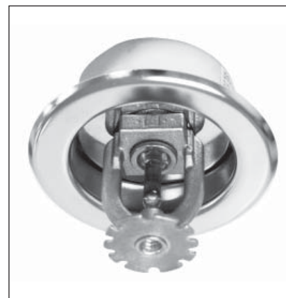
Recessed Extended Coverage Pendent F1/F2