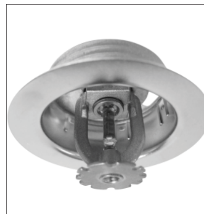
Recessed Extended Coverage Pendent FP