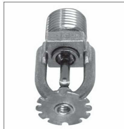
Extended Coverage Pendent

The most common applications for Model F156-300 EC Pendent and Recessed EC Pendent Sprinklers will be in fire protection systems for high rise buildings or where the pressure entering the sprinkler system is in excess of 175 psi (12 bar). The use of these sprinklers will provide an opportunity to reduce or eliminate the need for pressure reducing valves.