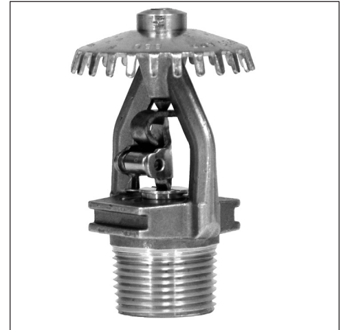
Sprinkler Identification Number RA1124