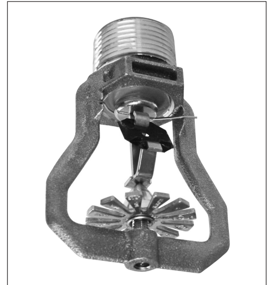
Model HL22 Sprinkler

Installation and Obstruction Criteria: Same as for K25.2 ESFR sprinklers, but with a maximum deflector to ceiling distance of 14 in. (356 mm)