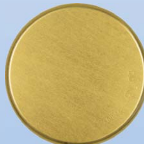
Raw Brass (Lacquered)