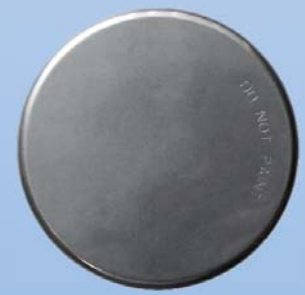
Stainless Steel Clad