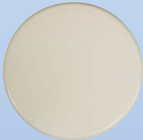
Off White Paint