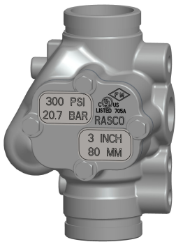
Model E3 - Grooved x Grooved