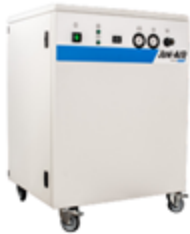
120R-40MQ3 & 2x120R-40MQ6 metal cabinet models shown