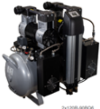
2x120R-90BQ6 model shown