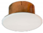
RFC Series Residential Sprinklers Flat Cover Plate, Concealed Pendant Sprinklers