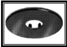
C One Piece