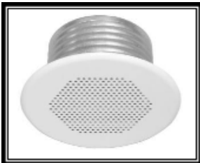
New - Perforated Cover Plate