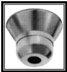
HB Two Piece