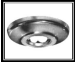
B One Piece