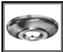
B One Piece