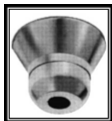
HB Two Piece