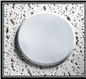
MODEL G1 CONCEALED REPLACEMENT COVERPLATES