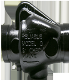
G Swing Check • See Bulletin 807