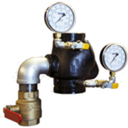
G Right Check Riser • See Bulletin 806