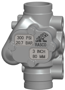
Model E3 - Grooved x Grooved