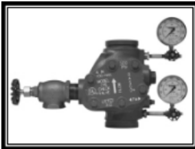
CVE Swing Check • See Bulletin 810