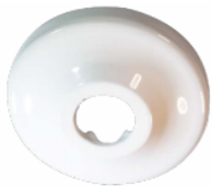
B One Piece