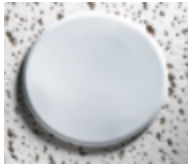
MODEL G1 CONCEALED REPLACEMENT COVERPLATES