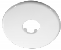
C One Piece