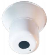
HB Two Piece