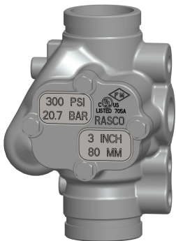
Model E3 - Grooved x Grooved