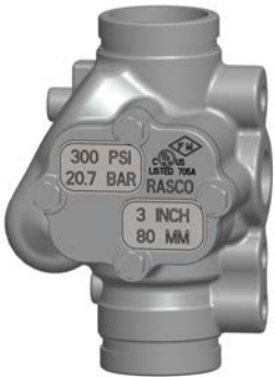
Model E3 - Grooved x Grooved