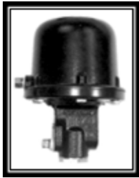
Model B-1 Accelerator