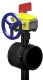
REL363GT BUTTERFLY VALVE - NORMALLY CLOSED • See Bulletin 835