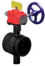
REL300GT BUTTERFLY VALVE - NORMALLY OPEN • See Bulletin 833