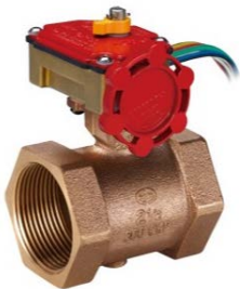
RBVT THREADED BUTTERFLY VALVE