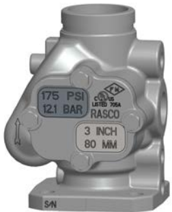
Model E - Flanged x Grooved