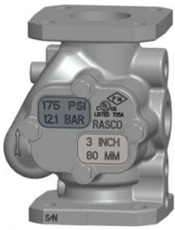
Model E - Flanged x Flanged