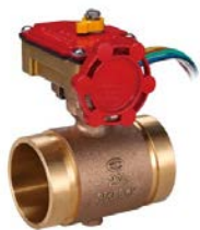
RBVG GROOVED BRONZE VALVE