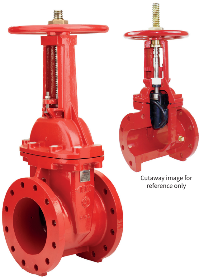
Cutaway image for reference only