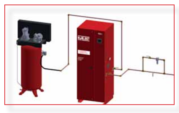
Typical System Installation.