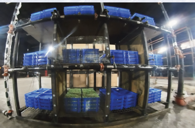
Li-ion test setup