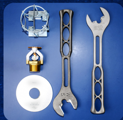
Compact, wrenchable guard and shield for in-rack applications