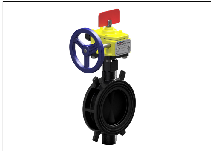
Model REL363WC Butterfly Valve - Supervised Normally Closed