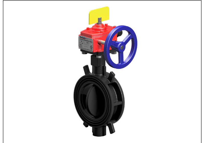
Model REL363W Butterfly Valve - Supervised Normally Open