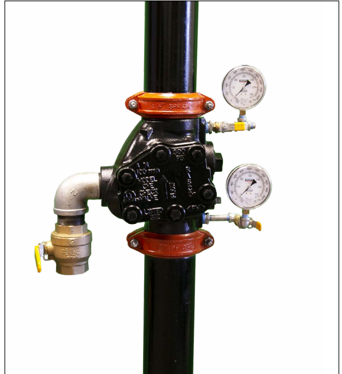
Model CVE Check Valve

The Model CVE Riser Check Valve is designed for use as a wet system riser or zone control, and includes supply and system-side pressure gauges and a two-inch ball valve main drain. The Riser Check trim may be ordered separately or factory assembled.