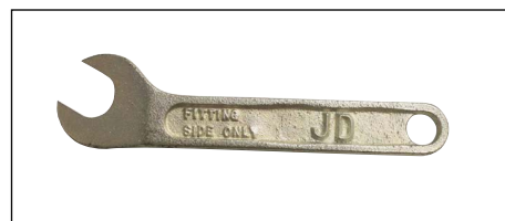
Model JD Wrench