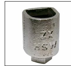
Model ZX-HSW Wrench