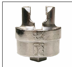
Model RJ Wrench