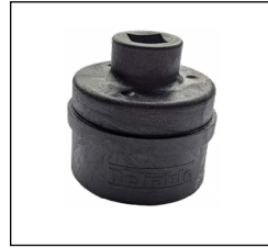
Model W8 Wrench