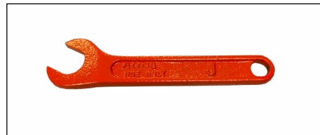
Model J Wrench