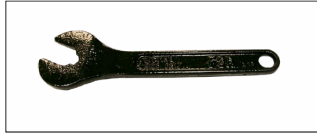
Model F3R Wrench