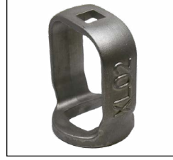
Model XLO2 Wrench