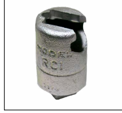
Model RC1 Wrench