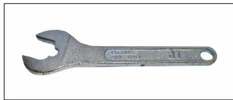
Model J1 Wrench