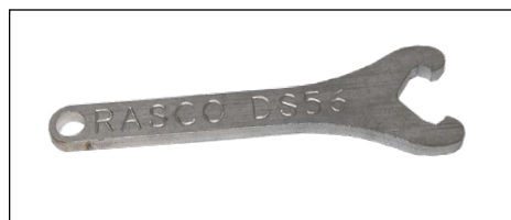
Model DS56 Wrench