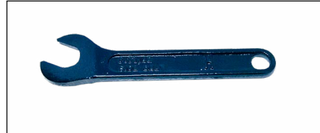
Model H Wrench