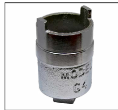
Model G4 Wrench