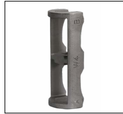
Model W4 Wrench