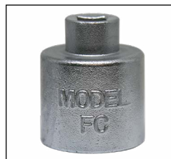
Model FC Wrench