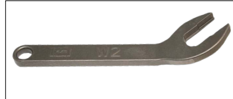
Model W2 Wrench