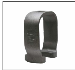
Model W1 Wrench