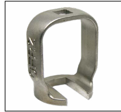
Model GFR2 Wrench