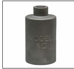
Model W3 Wrench