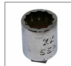
Model ZX Wrench