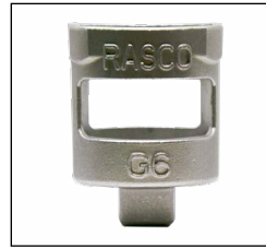
Model G6 Wrench