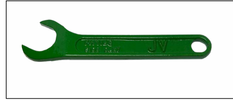
Model JV Wrench