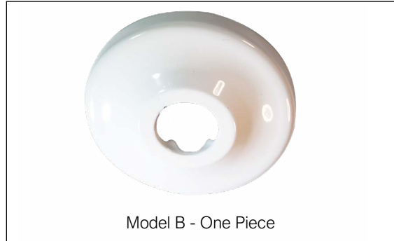
Model B - One Piece