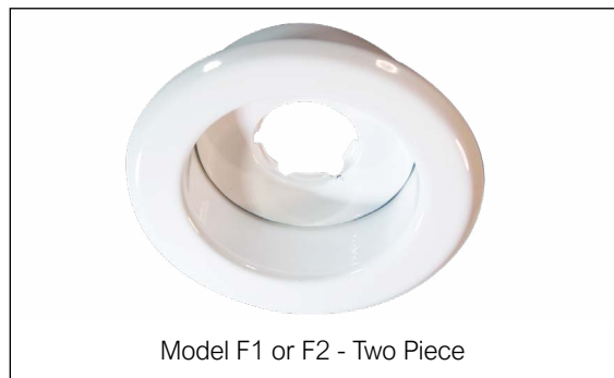
Model F1 or F2 - Two Piece