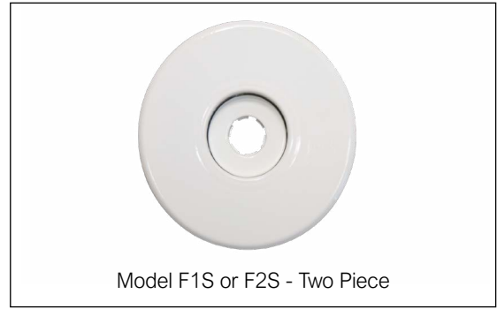
Model F1S or F2S - Two Piece