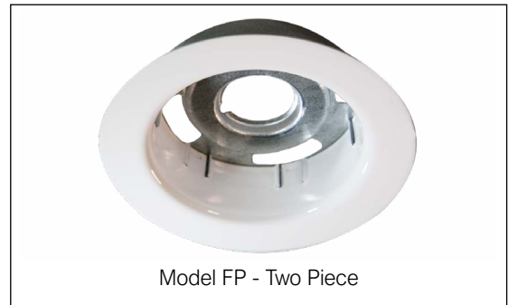
Model FP - Two Piece

Caution: The Model FP escutcheon is not intended for use where the space above the ceiling is positively pressurized with respect to the occupied space below.