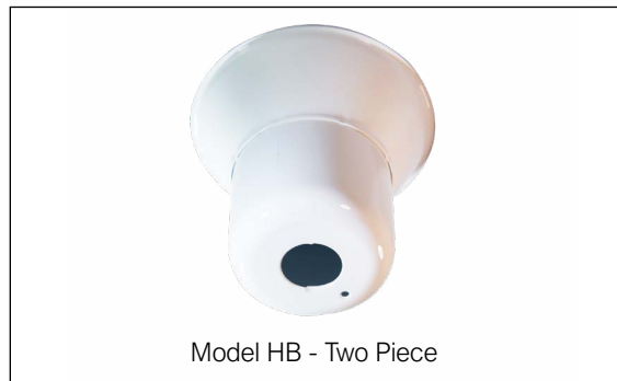
Model HB - Two Piece