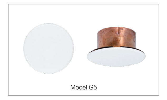
Plate: Finished brass Skirt: Copper plated steel Springs: Steel