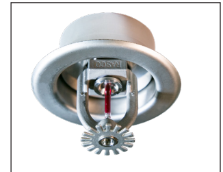
Model F1FR40 Pendent Recessed, F1 Escutcheon (F2 escutcheon similar)