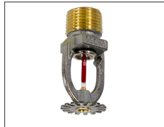
Model F1FR40 Pendent

Important! Reliable fire sprinklers must be handled, stored, and installed in accordance with the guidelines in Caution Sheet 310 and this bulletin. Failure to follow these instructions may result in unintended operation or nonoperation of the fire protection system.