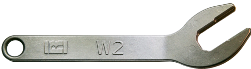
Model W2 (pendent)