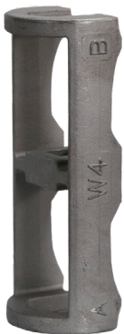
Model W4 (recessed pendent)