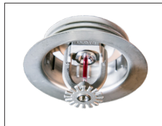
Model F1FR40 Pendent Recessed, FP Escutcheon

Note: Not all versions of the product are shown.