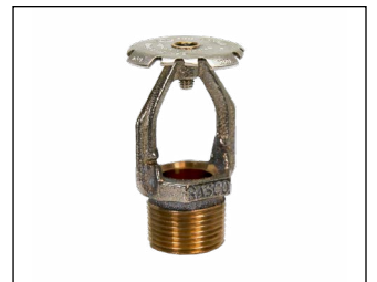
GFR VELO ECOH Upright