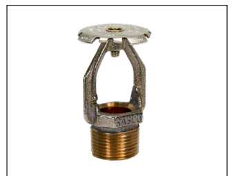
GFR VELO ECOH Upright