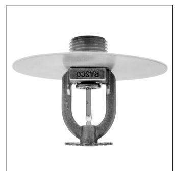
Model F1FR56 Pendent Intermediate

Glass bulb sprinklers have orange covers to protect the bulb during the installation process. REMOVE THIS PROTECTION ONLY AFTER THE SYSTEM HAS BEEN HYDROSTATICALLY TESTED. Model W2 and W4 wrenches are designed to install sprinklers when covers are in place.