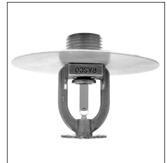
Model F156 Pendent Intermediate