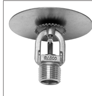
Model F156 Upright Intermediate

Model F156 sprinklers are standard response sprinklers and Model F1FR56 are quick response sprinklers. Both types are intended for installation as specified in NFPA 13. Upright sprinklers must be installed with the Model D Sprinkler Wrench specifically designed by Reliable for use with these sprinklers, and pendent sprinklers must be installed with the Model W4 Sprinkler Wrench specifically designed by Reliable for use with these sprinklers.