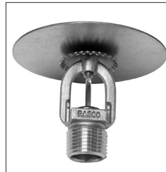
Model F1FR56 Upright Intermediate