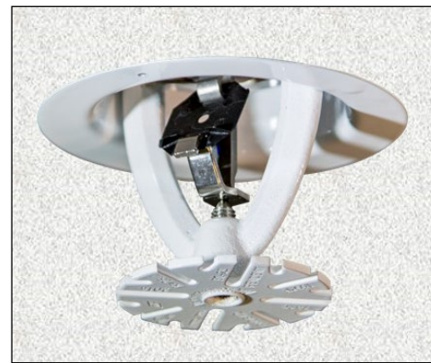
Recessed Pendent (UL only)

To further the development of environmentally compatible and more sustainable construction methods, Reliable has developed and ASTM International has published an Environmental Product Declarations (EPD) for the Model N252EC Pendent sprinklers.