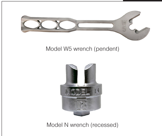
Model W5 wrench (pendent)