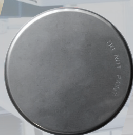
SS Clad Cover Plate