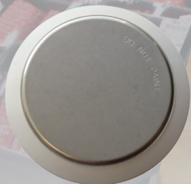
SS Clad Cover Plate w/SR Gasket