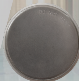
SS Clad Cover Plate w/QR Gasket

Stainless steel (316) clad cover plates are now available for: