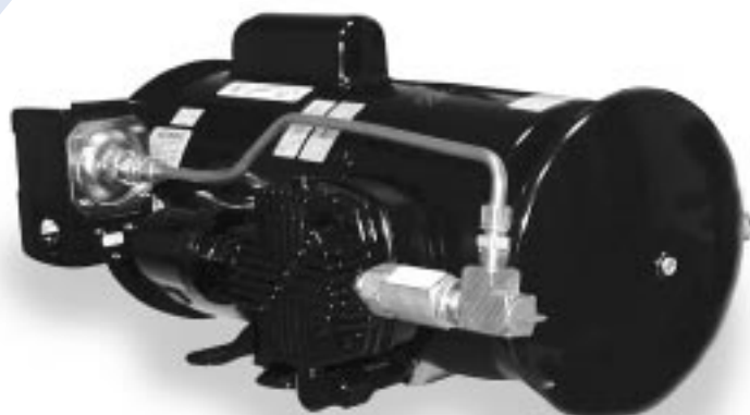
Tankless Automatic Model 4LCB-46S-M450GX