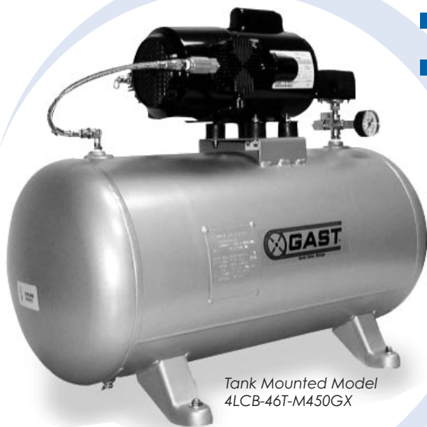
Tank Mounted Model 4LCB-46T-M450GX

GAST A UNIT OF IDEX CORPORATION www.gastmfg.com