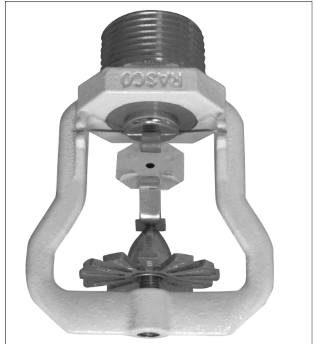
Model HL22 Specific Application ESFR Sprinkler

This sprinkler is intended for protection of Class I to IV Commodities and cartoned unexpanded Group A or B plastics. The storage can be palletized and solid piled, open frame single row or multiple row and portable rack storage for storage heights to 43ft. (13m) in buildings with ceilings to 48ft. (14.6m) high.