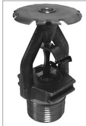
Model JL112 Upright (R 7326) - Link