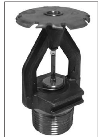
Model J112 Upright (RA 7326) - Bulb

This ECLH/ECOH sprinkler is available in various finishes, which includes a white polyester corrosion resistant finish.