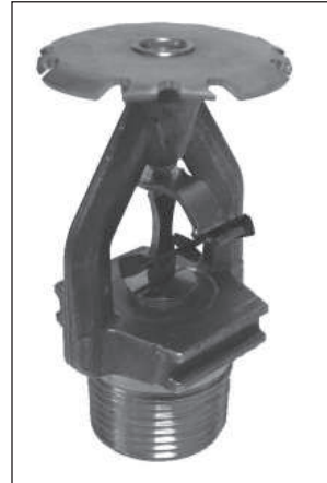
Model JL112 Upright (R7326) - Link

SIN RA7326 is Corrosion Resistant with White Polyester Coating.