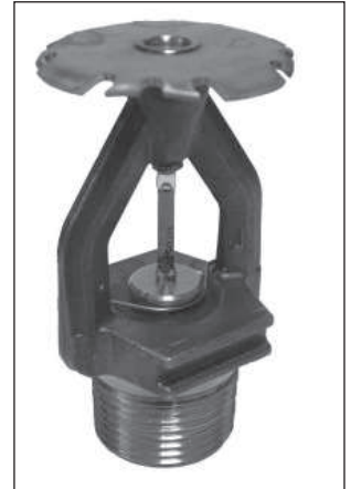
Model J112 Upright (RA7326) - Bulb