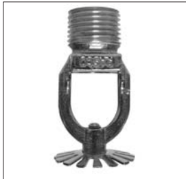
Model F1 Standard Pendent