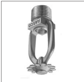
Model G Standard Pendent