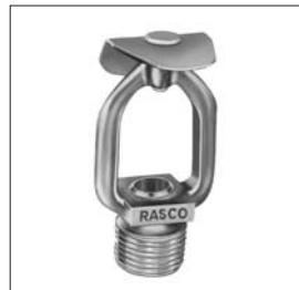
Model G Vertical Sidewall