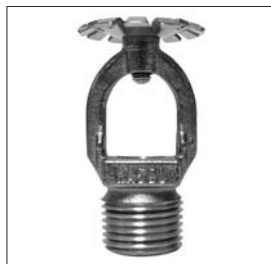
Model F1 Standard Conventional