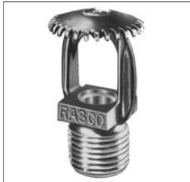
Model F1 Standard Upright

Models G and F1 standard upright and pendent sprinklers distribute water laterally and downward in a wide pattern approximating a half sphere. This hemisphere is completely and uniformly filled with water in the form of small drops and spray. A circular area, from 12 to about 20 ft. (3.7 to 6.1m) in diameter, is covered 10 ft. (3.0m) below the sprinkler at minimum water discharge pressure. See Technical Bulletins 110 and 117.