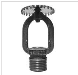
Model G Standard Upright