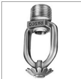
Model G Standard Conventional

This deflector configuration is used primarily in those countries where the LPC installation rules have precedence. The sprinkler distributes approximately 60% of its water discharge upward against the ceiling with the balance downward. It may be installed in either the upright or pendent position. Sprinklers with conventional deflectors are available with orifice sizes corresponding to light, ordinary and extra-hazard installations. See Technical Bulletins 110 and 117.