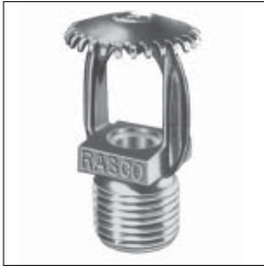
Model F1 Standard Upright

Models G and F1 standard upright and pendent sprinklers distribute water laterally and downward in a wide pattern approximating a half sphere. This hemisphere is completely and uniformly filled with water in the form of small drops and spray. A circular area, from 12 to about 20 ft. (3.7 to 6.1m) in diameter, is covered 10 ft. (3.0m) below the sprinkler at minimum water discharge pressure. See Technical Bulletins 110, 117 and 013.