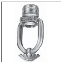
Model G Standard Conventional

See Technical Bulletins 110, 117 and 013.