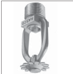
Model G Standard Pendent