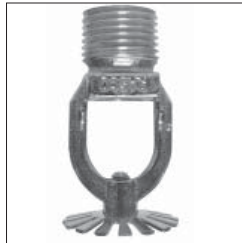
Model F1 Standard Pendent