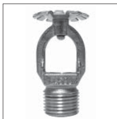
Model F1/F156 Standard Conventional