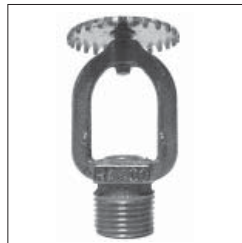
Model G Standard Upright