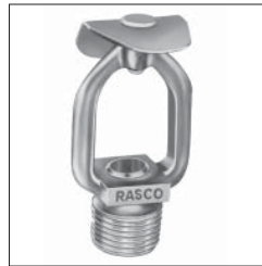
Model G Vertical Sidewall

The Model G & F1 Horizontal Sidewall Sprinklers are intended for light hazard occupancies and in some applications may be used in ordinary hazard occupancies. See Technical Bulletins 112, 117 and 013.