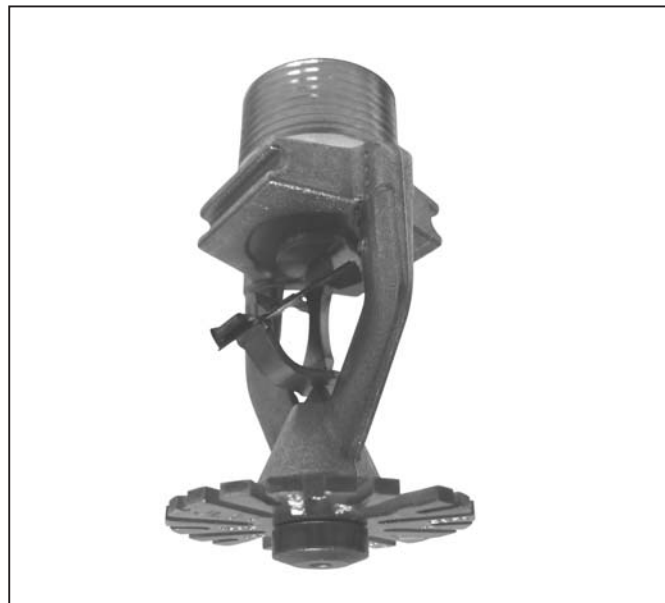
Model JL-14 ESFR Sprinkler

The Model JL-14 ESFR Sprinkler is UL Listed and Certified for Canada (all ratings) for installation in accordance with NFPA Standards for storage heights to 35 ft. (10.7m) in buildings to 40 ft. (12.1m) high without in-rack sprinklers & 40 ft (12.1m) storage height in buildings 45 (13.7m) ft. high with one level of in-rack sprinklers.