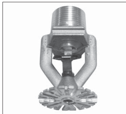
Model JL-14 ESFR Sprinkler

The Model JL-14 ESFR Sprinkler is FM approved [165°F (74°C) and 212°F (100°C) temperature ratings only] for use in buildings to 45 ft. (13.7m) high with storage heights to 40 ft. (12.1m) when installed in accordance with Factory Mutual Loss Prevention Data Sheet 8-9 and Data Sheet 2-0 and other FM Installation Standards.