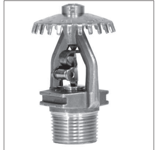
Sprinkler Identification Number RA1124