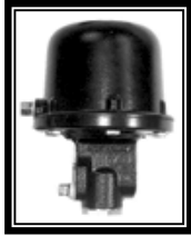
Model B-1 Accelerator