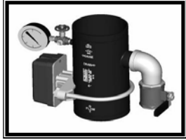
Model CR Commercial Riser