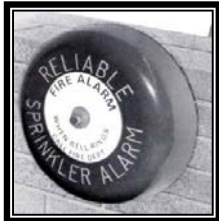
C — Mechanical Spk. Alarm