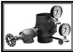
G Right Check Riser