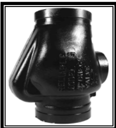
G Swing Check