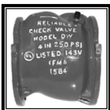
DW Swing Check