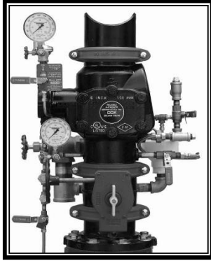
DDX Deluge Valve