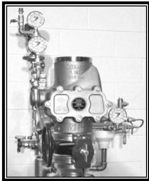
DDX Deluge Valve Stainless Steel - 8" Size