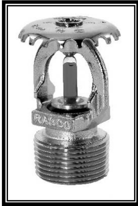
MODEL F1-300 UPRIGHT