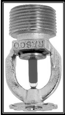
MODEL F1-300 EC