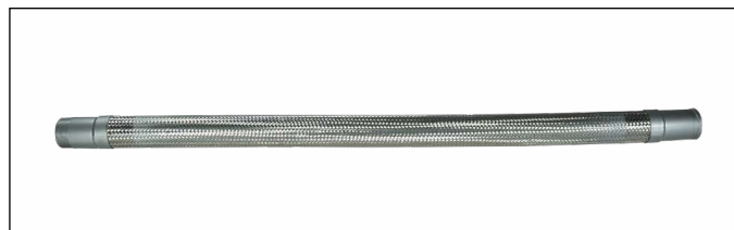
2" x 48" MNPT x Groove